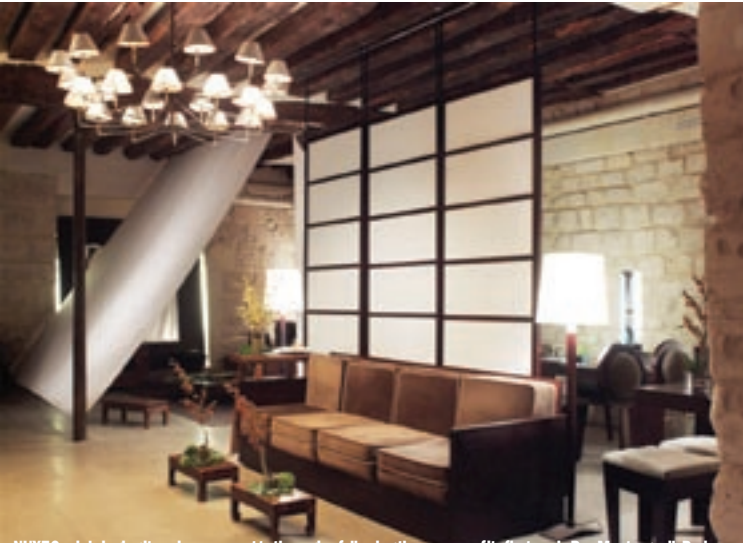
NUXE Spa is bringing its unique concept to the region following the success of its first spa in Rue Montorgueil, Paris.

Furthermore, France is renowned for its luxury products and services. "I believe French products are